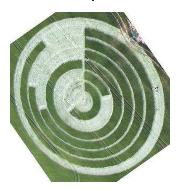
Fig. 1: Manton Drove, nr Marlborough, Wiltshire, 2nd June 2012

We believe the formation reported on 2nd June 2012 resembles a polar clock. It is a kind of clock showing not only the time, but also the date. In order to analyse the message depicted in the formation, we first had to rotate the image (see Fig. 1). After that, we executed the application PolarClock3 (by PixelBreaker). Then we set the date and time so that the polar clock displayed on our monitor screen was the same as the one on the formation.